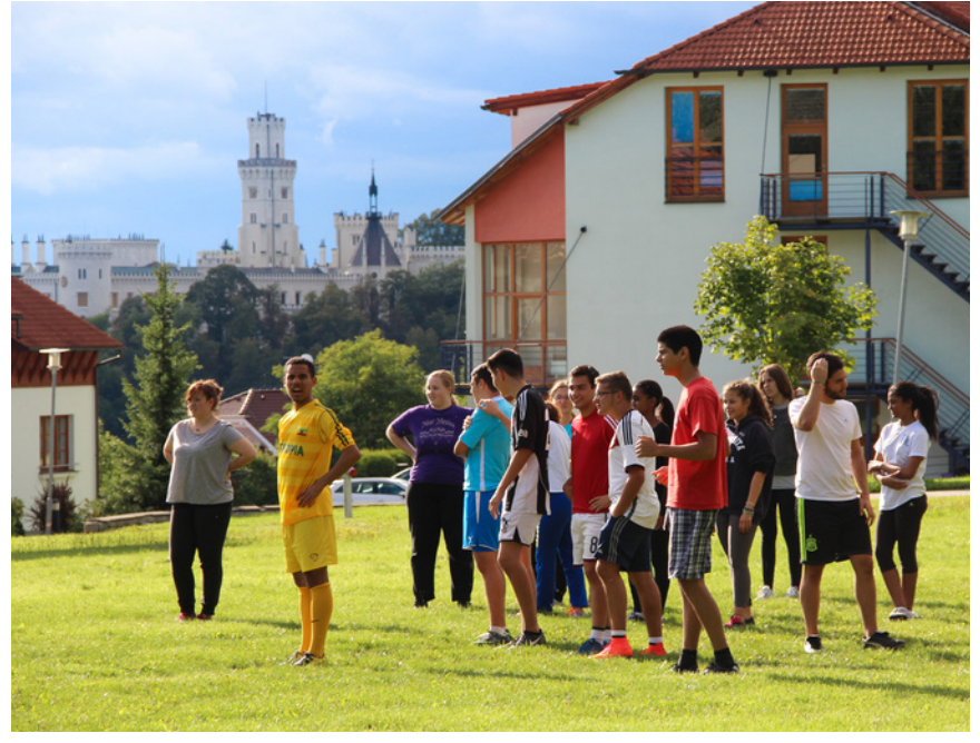
Townshend International School